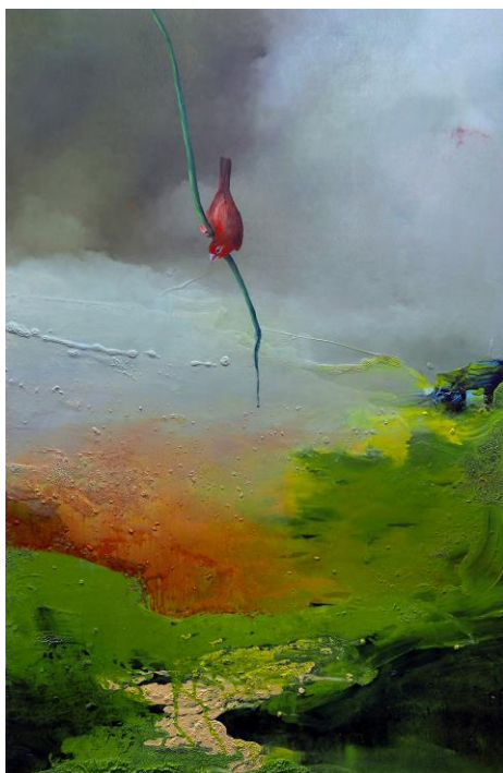
Resa Blatman Toxic Bloom 2 , 2018 Oil and acrylic on panel, 36 x 24 inches

envisioning displaced species within a world in flux. Blatman contrasts her skillfully rendered flora and fauna with dark, turbulent backgrounds, heightening the creeping feeling of unease within her work. While looking towards a chaotic future, Blatman also looks to the past, peppering her work with art historical references. Paintings like Toxic Bloom 2 and Refugees reference Martin Johnson Heade's naturalist landscapes but diverge with frenzied colors and frantic calls to action. Blatman visually articulates the messages of scientific data on climate change - in her paintings, prints, and drawings, human action and inaction have wrought catastrophic natural consequences. The artist gives us hope, however, through the various animals that persist within her tumultuous landscapes - though the conspicuous absence of human figures is telling. Blatman presents an alluringly bleak world in the hope that we may avoid this fate. Her lushly constructed artwork is a warning against this particular glimpse of our possible future.